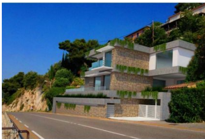
Vente villa au Vista-Palace Roquebrune Cap Martin, hauteurs de Monaco