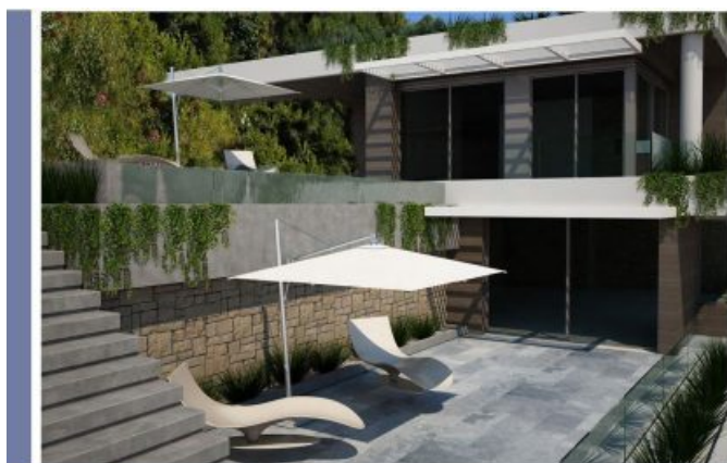
Vente villa au Vista-Palace Roquebrune Cap Martin, hauteurs de Monaco