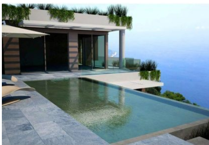
Vente villa au Vista-Palace Roquebrune Cap Martin, hauteurs de Monaco