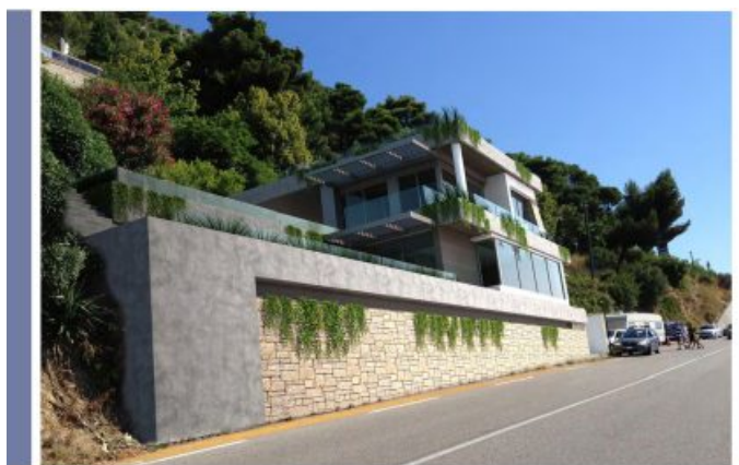
Vente villa au Vista-Palace Roquebrune Cap Martin, hauteurs de Monaco